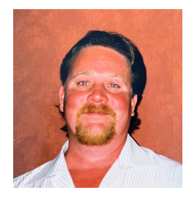
IN THE CARE OF